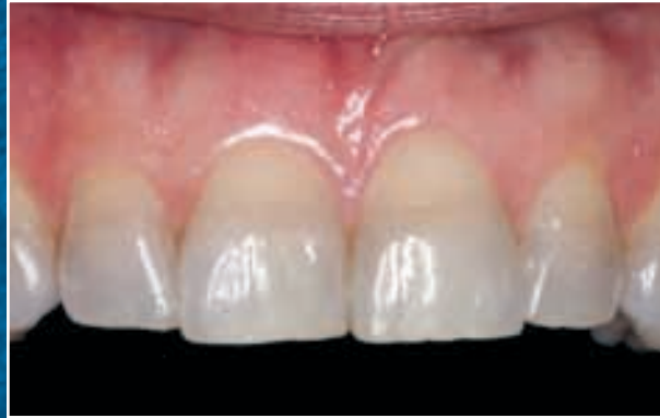
Minimal Tooth Reduction