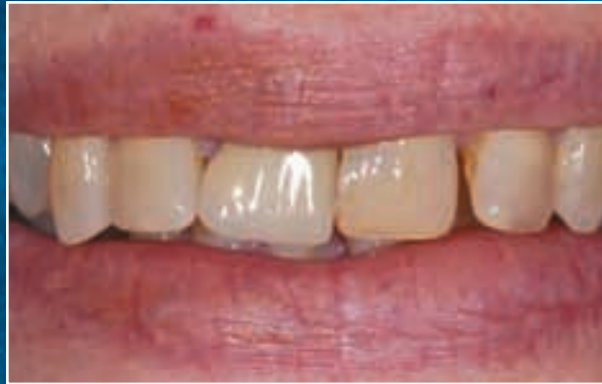
Minimal Tooth Reduction

This 51-year-old female patient had a history of parafunctional activity that caused excessive wear on the incisal edges of her anterior teeth. Also, the facial surfaces of her anterior teeth were rough and irregular making them prone to staining. A diagnostic wax-up helped determine the amount of preparation needed for the esthetic goal. Empress veneers from #5-#12 were used to restore her smile. The patient was happy with the final result.