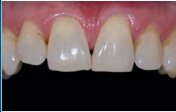
No Tooth Reduction