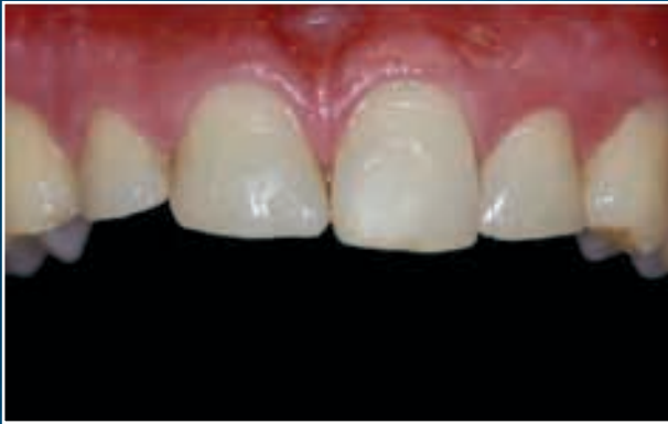
Minimal Tooth Reduction