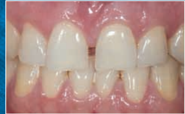
No Tooth Reduction

This 43-year-old female wanted to change the shade and alignment of her smile. Orthodontic treatment was suggested prior to placement of the veneers, but she declined. It was necessary to include veneers on the bicuspids and first molars to correct the alignment of the arch and create a pleasing buccal corridor. The teeth were aligned with a high speed handpiece prior to placement of the veneer depth cuts. Empress veneers were placed on teeth #3-#14.