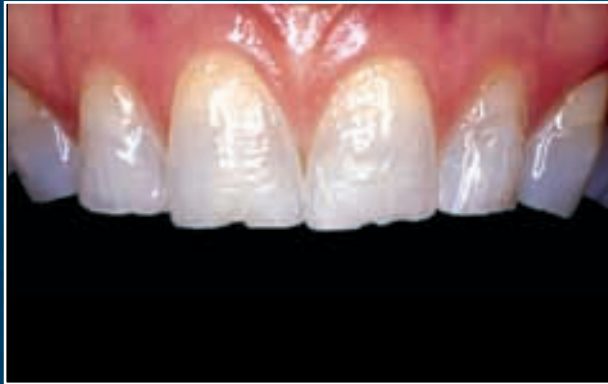
Minimal Tooth Reduction